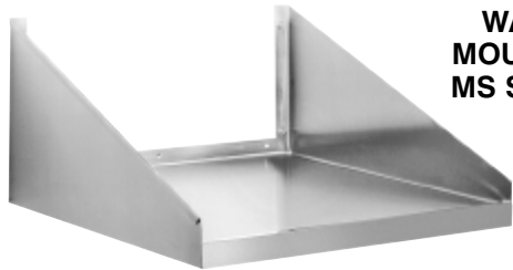
WALL MOUNTED MS Series