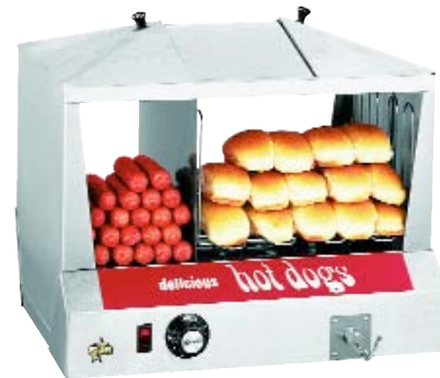
Model 35SSC Operator Side