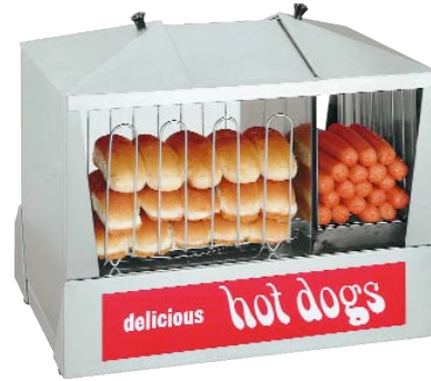
Model 35SSC Customer Side

Classic Steamro Jr. hot dog steamer is covered by Star's one year parts and labor warranty.