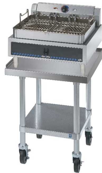
Model 530FD with Optional Equipment Stand with Casters

Star-Max® Electric Fryer is covered by Star's one year parts and labor warranty.